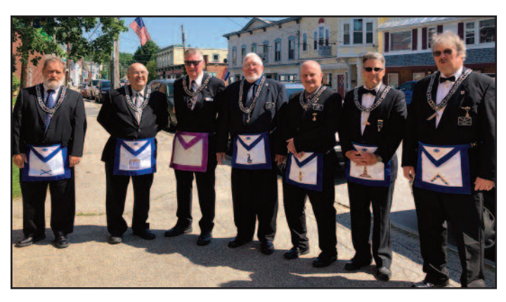
Unity #62 & Fraternal #71 participate in St. John's Sunday worship services at Farmington UCC